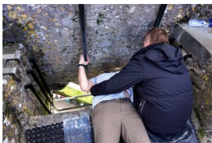
Kissing the Blarney Stone (optional!)